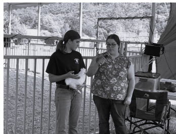
3 p.m. 4-H Poultry Showmanship