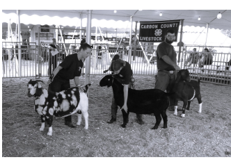
1 p.m. 4-H & Open Goat Show