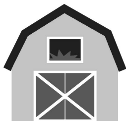
6pm Barnyard Olympics