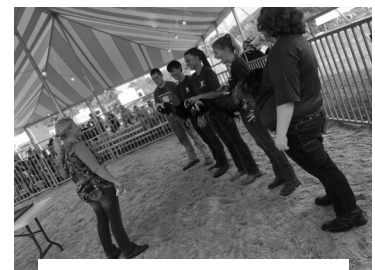
5 p.m. 4-H Showmanship Contest